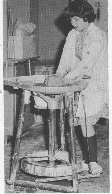
WHAT IS IT?