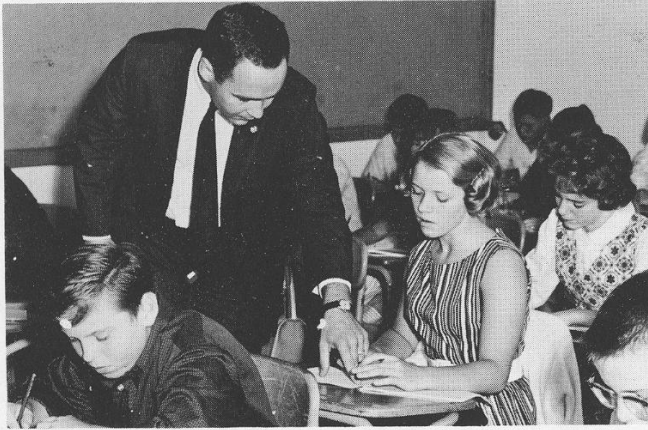
WHERE'S THE VERB?