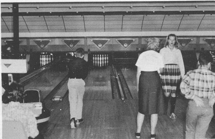
ROLL IT, DON'T THROW IT