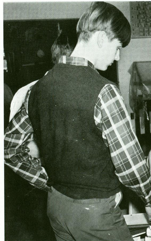
Biology students performed various experiments.