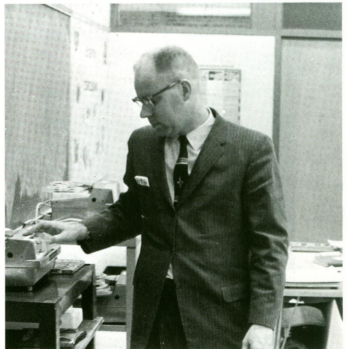
The tape recorder gave future accountants lectures and offered note-hand students an opportunity to take notes.