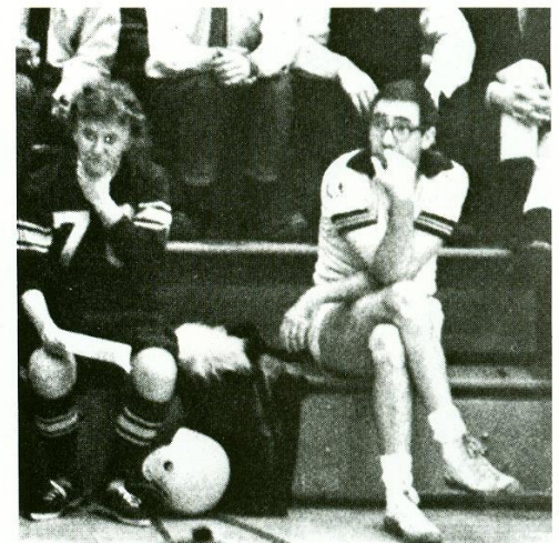
"I wonder what his name is?" "I wonder what her name is?"