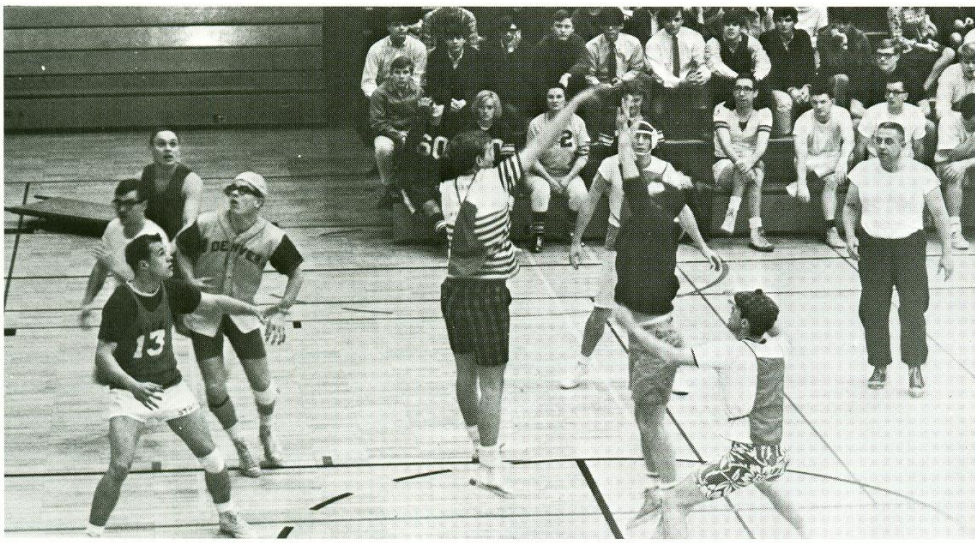
London Bridge is falling down.