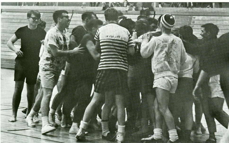
The funny company emerges triumphant.