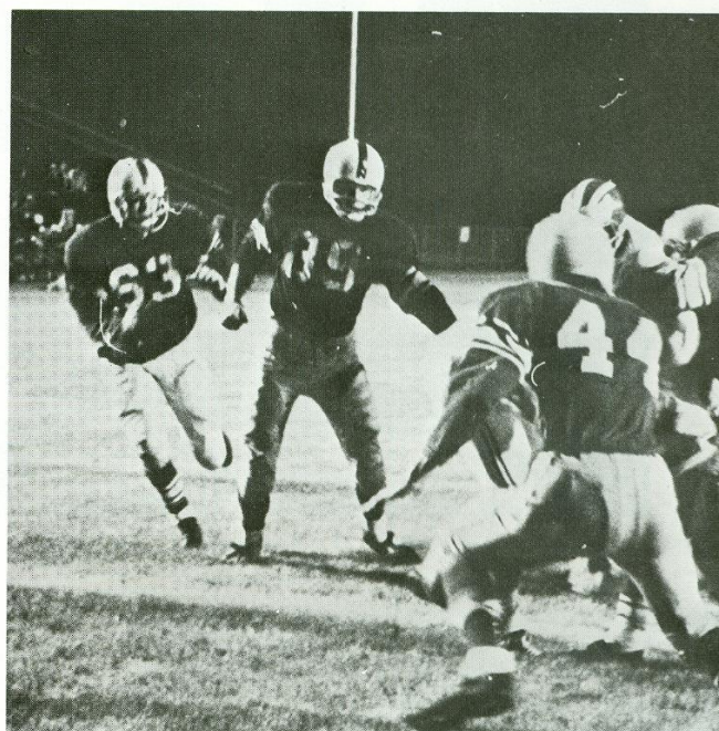
... Against Lincoln